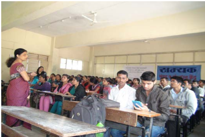
Value Education Workshop