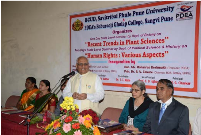
Seminar on Human Rights