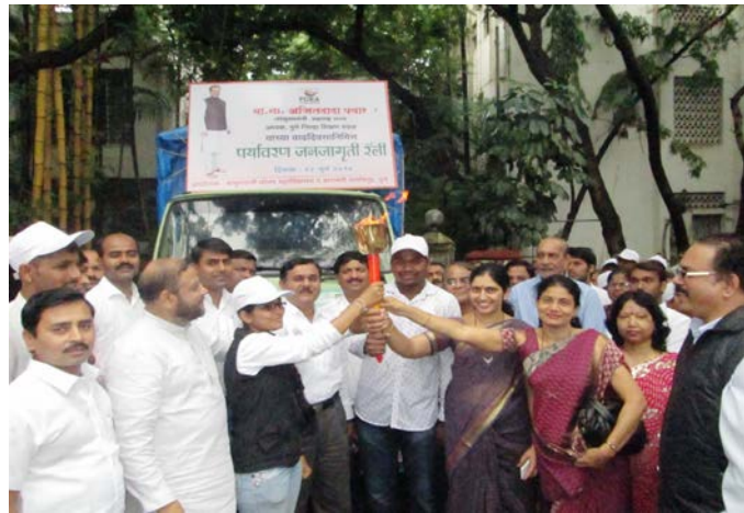
Environment Awareness Rally