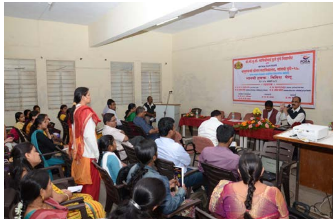
Panel Discussion in Human Rights Seminar