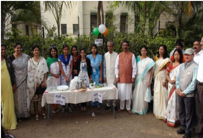
Entrepreneurship through Fun Fair Activity