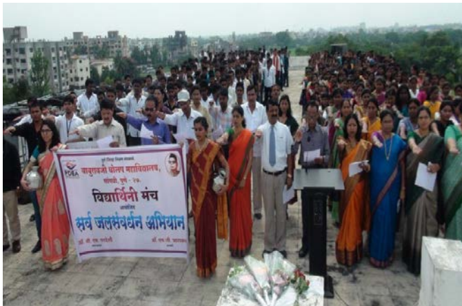
Drive of Water Save