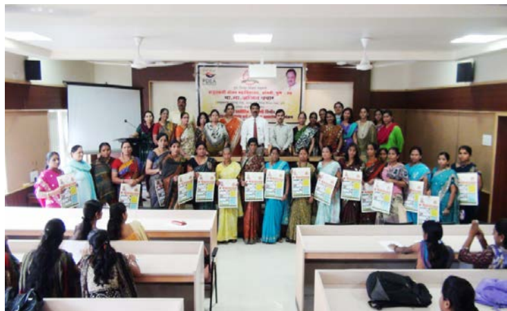
Diet Chart Distribution