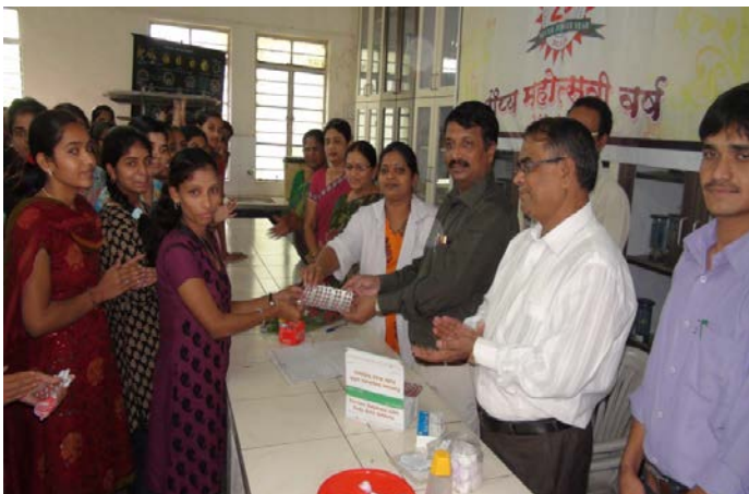
Iron Tablet Distribution