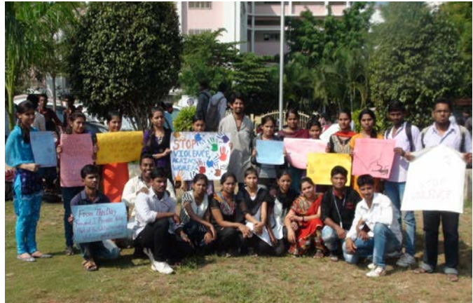
Street Play on Gender Equality