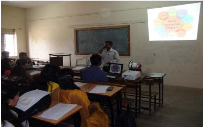
PPT Presentation in Value Education Workshop