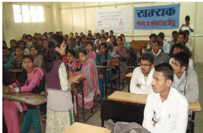
Counselling in Value Education Workshop