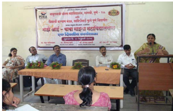
Workshop on My Parents in my College